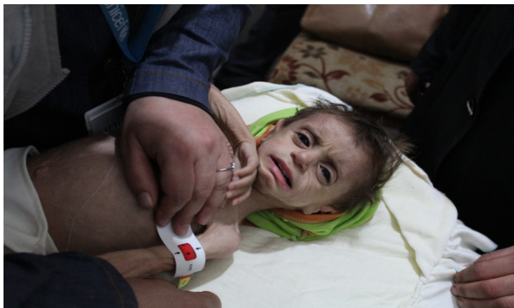
On 30 October 2017 in East Ghouta, rural Damascus, in the Syrian Arab Republic, a child is measured by a health professional with a Mid-Upper Arm Circumference (MUAC) measuring tape to determine whether he or she is suffering from severe acute malnutrition.